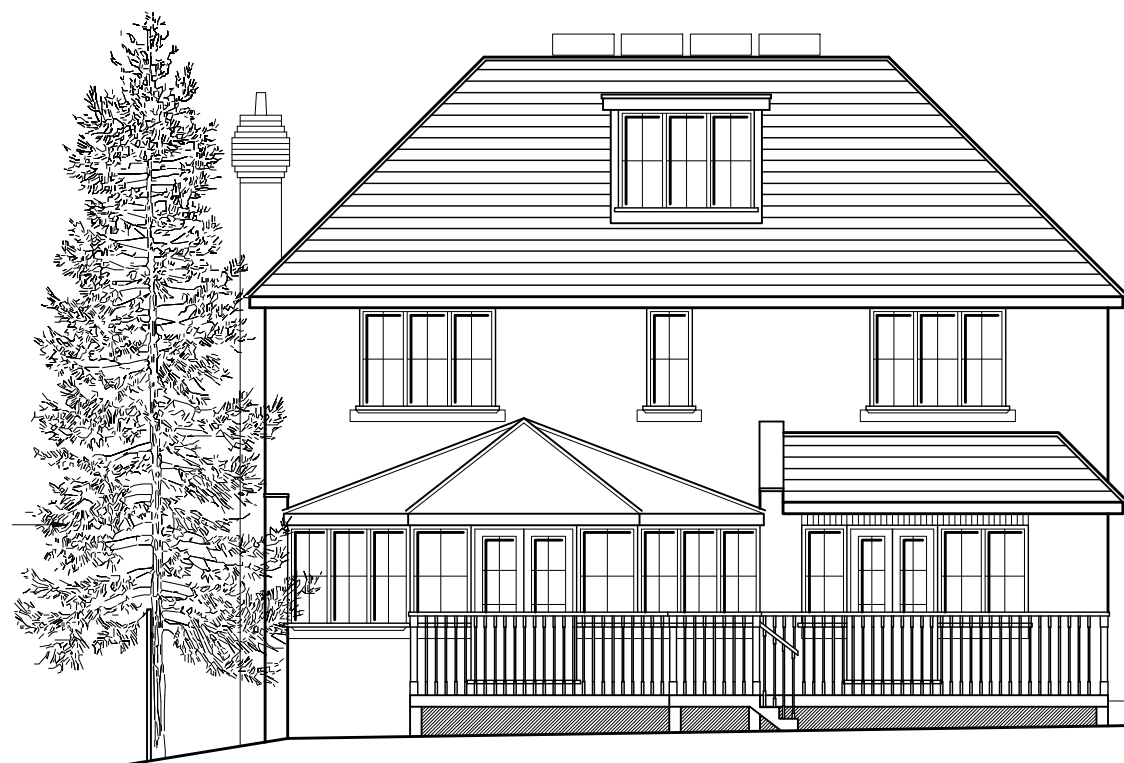
Rear elevation Plot 2